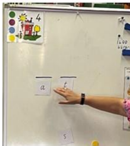
Saying letter sounds