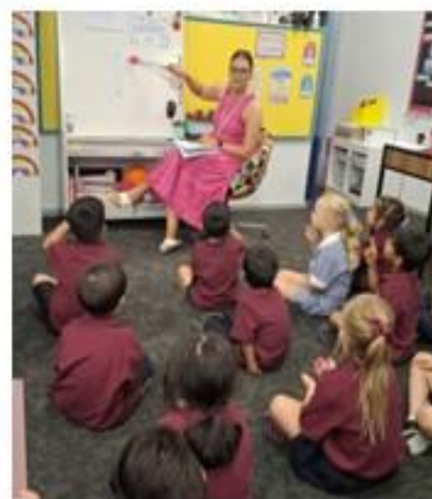
Saying letter sounds