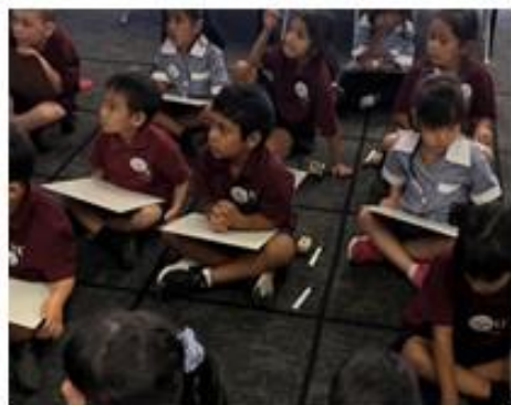
Park it - their eraser and marker