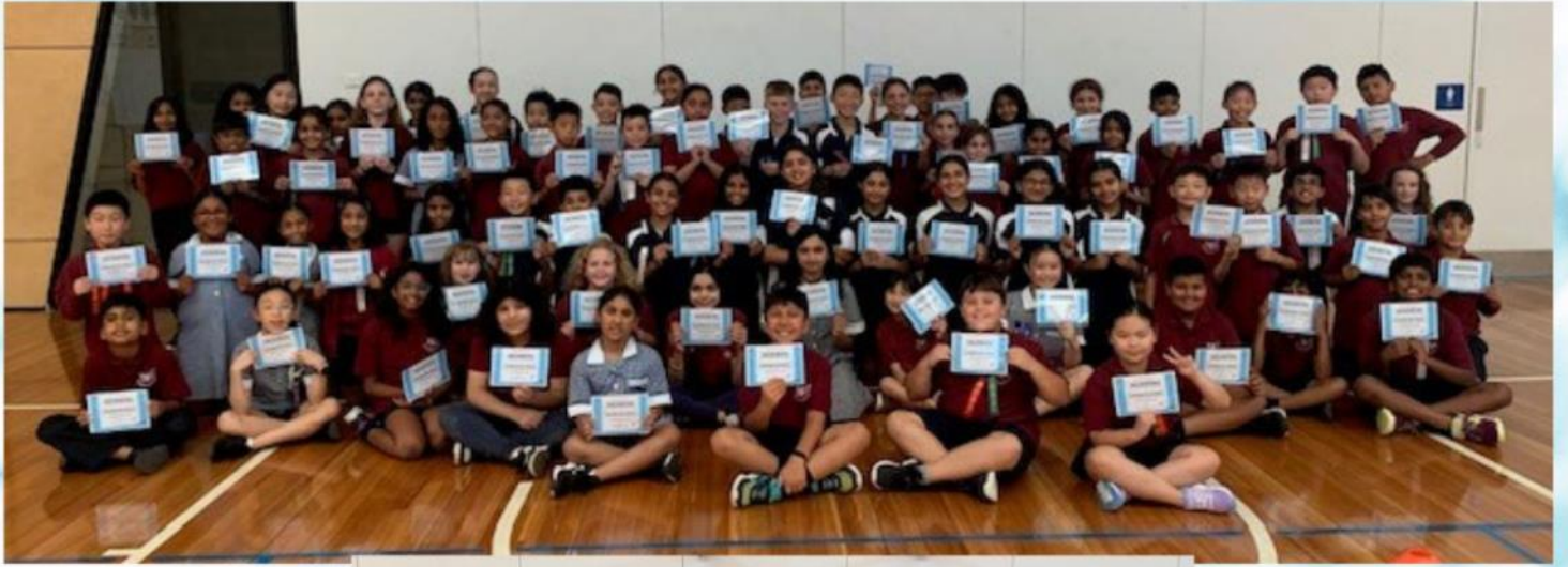
12 year olds